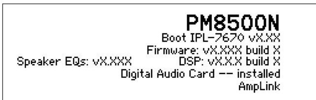
Figure 3. Amplifier LCD screen after AmpLink card is installed