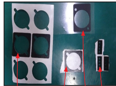
EVA1 EVA2 EVA3 EVA4